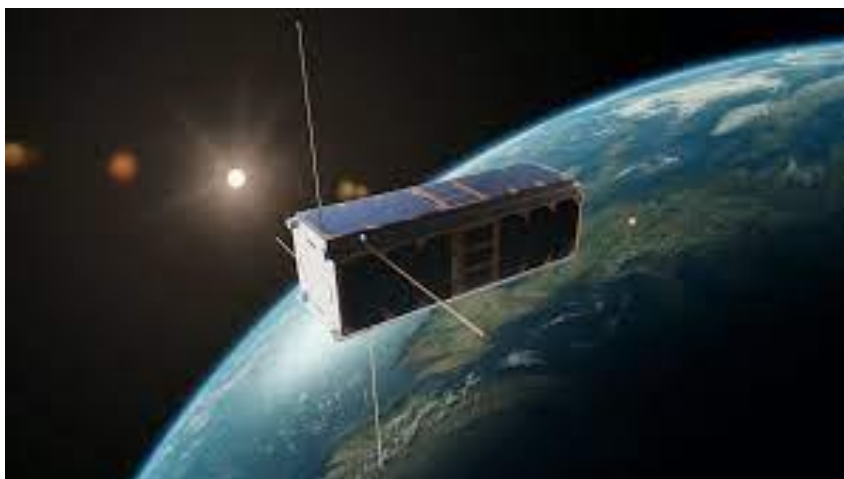
AstroBio Cubesat.